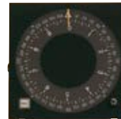
Steering repeater compass for console mounting with 360° and 10° compass cards Weight: 1.5 kg