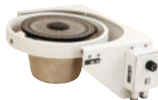
Bearing repeater compass with 360° card in a stand with azimuth device PV 23 Total weight: 16.1 kg