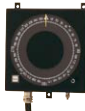
Bulkhead repeater compass with 360° card Weight: 2.9 kg