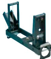
Prismatic azimuth device PV 23 Weight: 1 kg