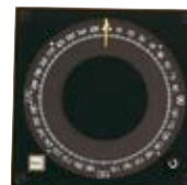
Console repeater compass with 360° card Weight: 1.5 kg