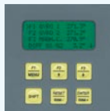
Remote Control and Display Unit * when available