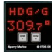
Universal Digital Repeater Weight: 1.0 kg with cable