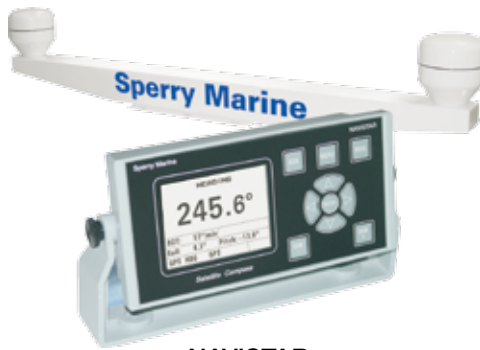
NAVISTAR Satellite Compass